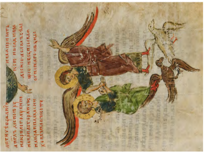
Figure 11. Abraham and Yahoel ascend to heaven on the wings of two birds.