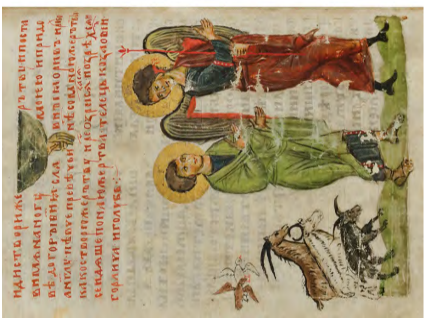
Figure 4. Abraham with sacrificial animals. Top: Photo of the facsimile version. Bottom: Photo of the Codex Sylvester.