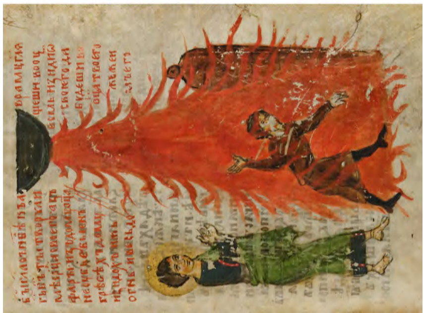
Figure 5. The house of Terah destroyed by fire.