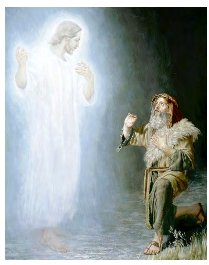
Figure 1. Joseph Brickey (1973-), Moses Seeing Jehovah, 1998.42