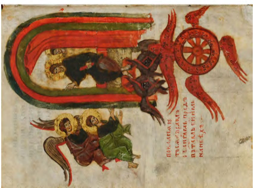
Figure 15. Abraham and Yahoel see the Lord face to face.