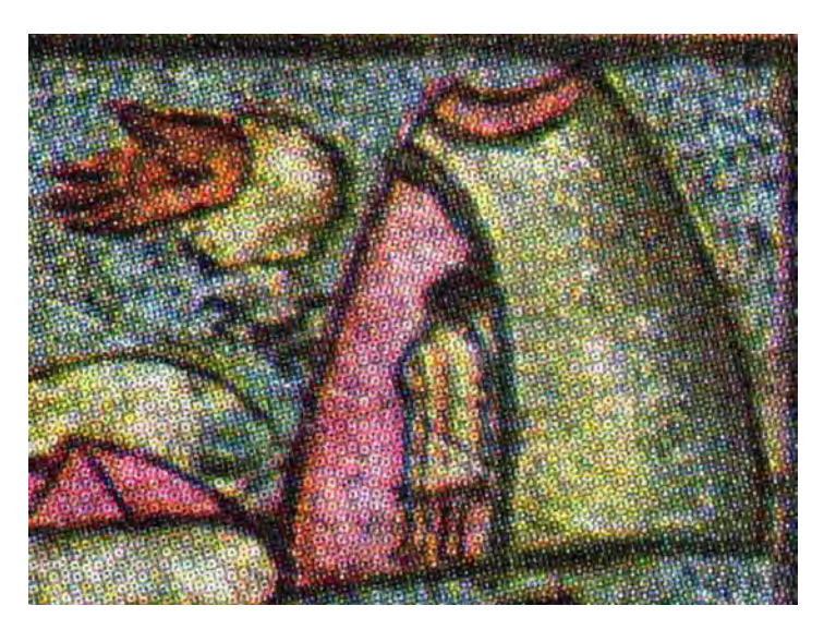
Figure 12. Detail above the Torah shrine of the Dura Europos synagogue. 201

Moses 1:25–31 describes Moses's revelation of God as a progressive phenomenon, beginning with "a voice" and ending with a "face to face" encounter. Notably, the same sequence of divine disclosure is present in the story of the brother of Jared's intimate encounter with the Lord "at the veil." In that account, the prayer of the brother of Jared is answered first with a divine voice (see Ether 2:22–25), then with the sight of the finger of the Lord (see Ether 3:6–10), and finally with a view of the "body of [His] spirit" (see Ether 3:13–20).