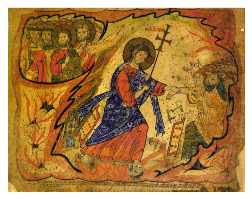
Figure 9. The Harrowing of Hell. The Barberini Exultet Roll, ca. 1087. <sup>148</sup> Note that Jesus is depicted as having two right hands, consistent with related accounts of God in Jewish midrash. <sup>149</sup>