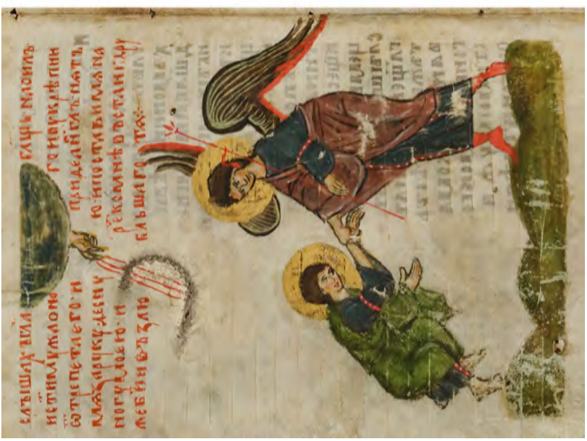
Figure 8. Abraham falls to the earth and is raised by Yahoel.