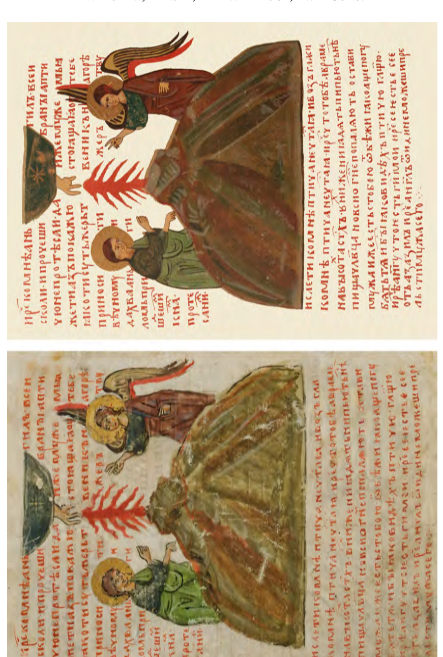
Figure 6. Abraham's sacrifice is accepted of the Lord.